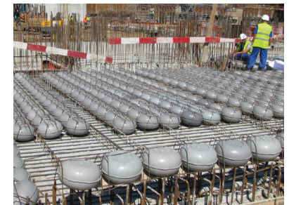
Filigree slabs produced by the precast factory, Baumat, Torun, are fitted with the Cobix void former elements on site.

emissions is 2.878t on just this project, which is the equivalent of driving 500 times around the Earth by car. ●